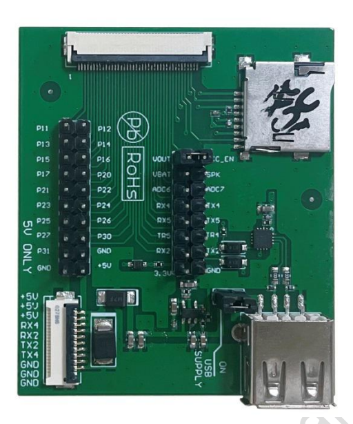
HDL 672 debug board

It is recommended for new users of DWIN smart LCMs to purchase official accessories. For more details, please refer to customer service center.